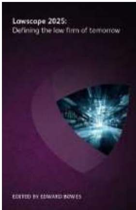
Edited by Bowes, Edward; LAWSCAPE 2025: DEFINING THE LAW FIRM OF TOMORROW