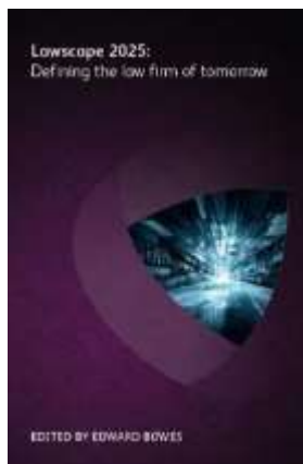
Edited by Bowes, Edward; LAWSCAPE 2025: DEFINING THE LAW FIRM OF TOMORROW